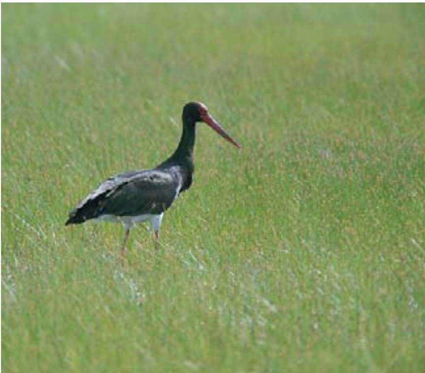
It is sometimes possible to find a Black Stork Ciconia nigra among the White Storks. © Antero Topp, Lesbos, huhtikuu 1999.

apivorus is a common breeding bird, together with the Black Kite Milvus migrans whose breeding activity in the area is considered extraordinary as this species breeds in only a few places in Greece. The Hobby Falco subbuteo is not difficult to find, and Peregrines F. peregrinus are also attracted by the huge concentrations of potential prey, while Eleonora's Falcon F. eleonorae is a rare summer visitor. In some years, in addition to the classic specialities, it is possible, at the end of the spring season, to observe noticeable numbers of Rosy Starlings Sturnus roseus , during their periodic irruptions.