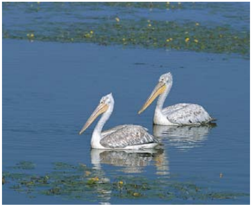
Many of the Dalmatian Pelicans Pelecanus crispus winter on Kerkini lake. © Ugo Mellone, Kerkini, 5.8.2002.

village, the remains of which are nowadays home to Common Sterna hirundo , Black Chlidonias niger and Whiskered Terns (with White-winged C. leucop-terus being a common migrant); a little farther on there is, on the left, a canal with an unbelievably high concentration of herons and Great Cormorants Phalacrocorax carbo , where we also saw a juvenile Goshawk Accipiter gentilis . The rest of the southeast side does not warrant much attention, in comparison to the rest of the lake, with only some Dalmatian Pelican and Great Crested Grebes spotted in the middle of the lake, rather far from the road. In addition, another interesting place is the little marsh below the dam; in particular it is one of the best sites to spot Glossy Ibis.