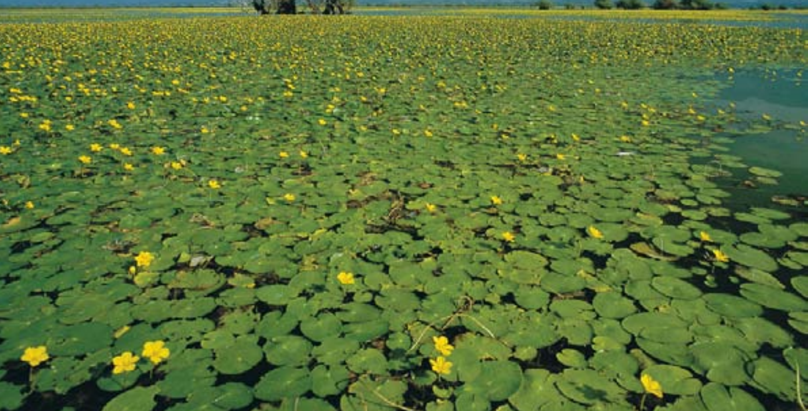
Blooming water-lilies at Kerkini. Kerkini, 7.8.2002.