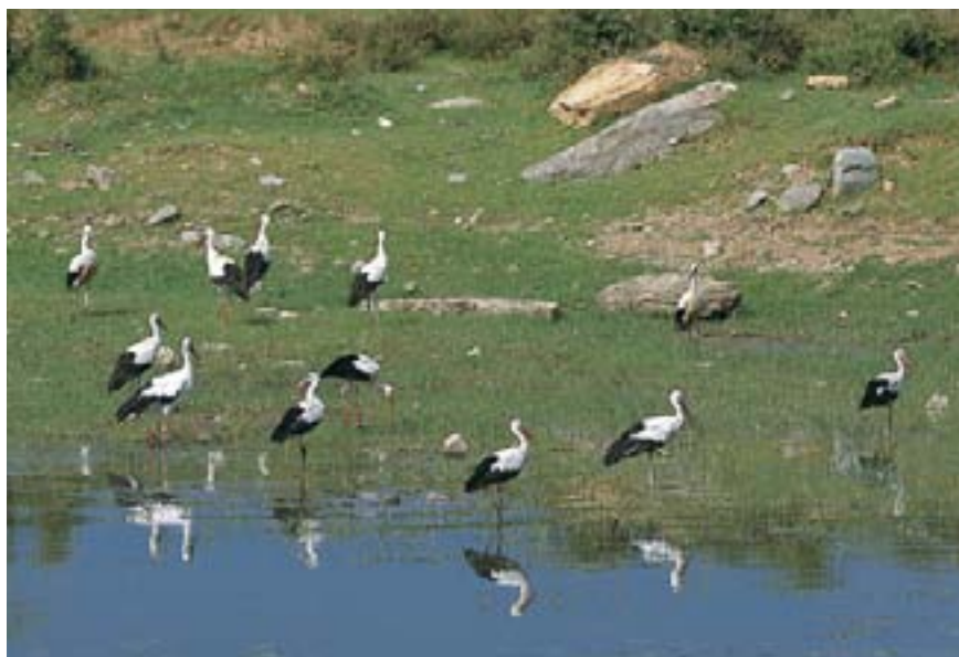
Dozens of White Storks Ciconia ciconia are often seen on the eastern shore. © Ugo Mellone, Kerkini, 4.8.2002.

The Lesser White-fronted Goose Anser erythropus winters almost every year, sometimes joined by Red-breasted Goose Branta ruficollis , Ruddy Shelduck Tadorna ferruginea and White-headed Duck Oxyura leucocephala which reach the lake in the coldest months, as do all three species of swan. The White-tailed Eagle Haliaeetus albicilla is present year round, although it is easier to observe in winter. The Honey Buzzard Pernis