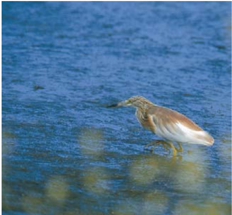
Squacco Herons Ardeola ralloides prefer the ponds near the lake. © Antero Topp, Lesbos, huhtikuu 1999.

Other interesting species breed in the lowlands such as Eastern Olivaceous Hippolais pallida and Olive-tree Warblers H. olivetorum , Cirl Emberiza cirrus , Black-headed E. melanocephala and Corn Buntings Emberiza calandra . Spanish Sparrow Passer hispaniolensis also breeds in the isolated stork nest in the water on your right just some one hundred metres before the village of Kerkini. After Kerkini, be careful not to continue on the main road to Livadia, and take the road along the shore instead, which allows you to get very close to Pygmy Cormorants. It is worth spending some time in this nice town, which gives its name to the lake. Almost all the houses have their own stork's nest, probably the highest breeding density in Greece and near the village we briefly saw a juvenile Lesser Spotted Eagle perched less than 10 m from the car feeding with Magpies Pica pica on