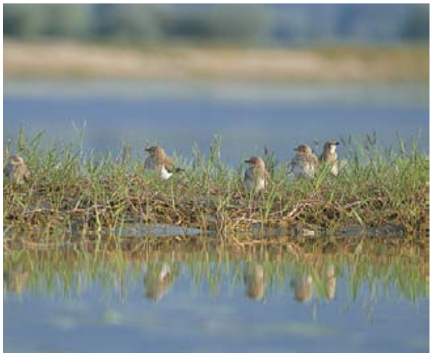
A colony of Collared Pratincole Glareola pratincola was surprisingly found on the small islets in the lake. Kerkini, 7.8.2002.

Continuing along the main road, after Livadia, turn right to Mandraki, where a road begins which allows you to see the northern side of the lake, which is not easy to visit because of the flooded forest. The most exciting zone of the Kerkini