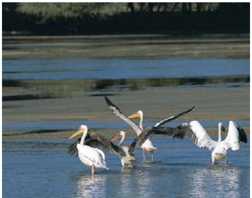
White Pelicans Pelecanus onocrotalus often prefer shallow water, so they are often seen close to the shore. © Ugo Mellone, Kerkini, 6.8.2002.

Kerkini Lake lies not far from the big city of Thessaloniki, between the mountains that separate Greece from Bulgaria and the surrounding plain created by the Strymon River. This lake has a particular story. After being drained it was again flooded by a dam in the 1950s and nowadays holds important populations of waterbirds - especially herons, cormo-