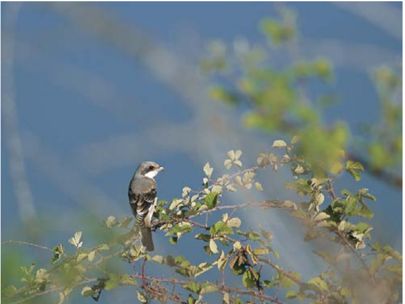
Kerkini is also an excellent place to study juvenile shrikes. This is a Lesser Grey Shrike Lanius minor . © Ugo Mellone, Kerkini, 5.8.2002.